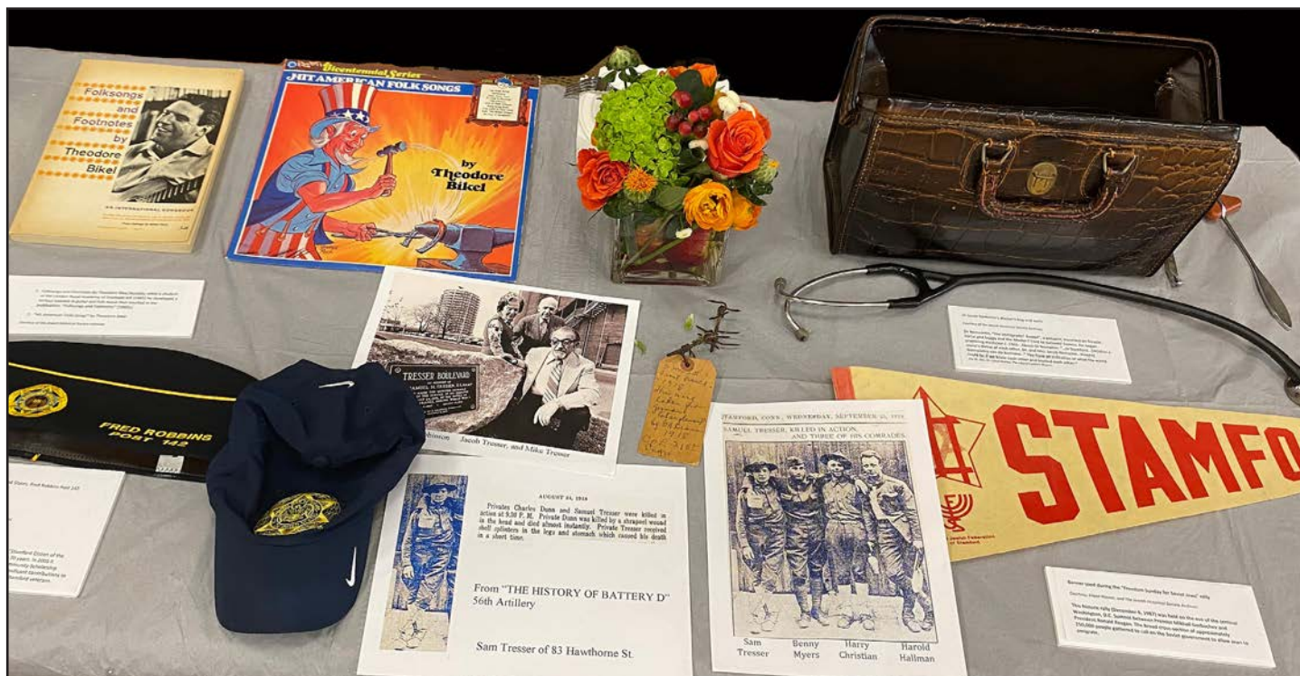
The JHSFC Archive displays a sampling of artifacts with descriptions at the It Happened Here! Exhibit at the Ferguson Library, downtown Stamford.

Since our beginning in 1983, we have facilitated the preservation of unique unpublished primary source materials and individual and family histories of our Jewish community. Beyond collecting and preserving, we prioritize engaging with the community with our original exhibits and educational programs.