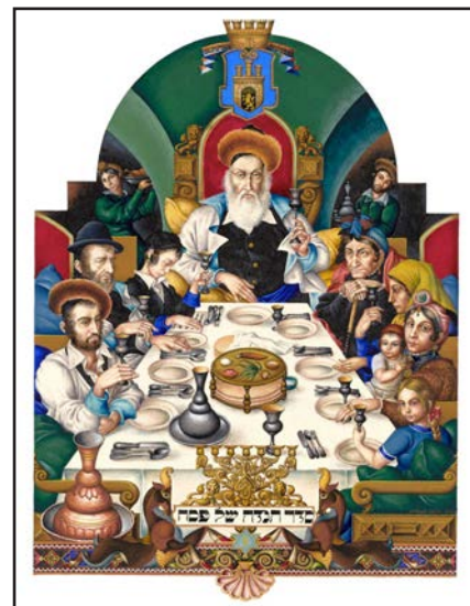
Sample page of JHSFC numbered copy of The Szyk Haggadah, illustrated by the Polish-Jewish artist Arthur Szyk.

The JHSFC Archives endeavors to proactively collect artifacts in order to uncover the hidden stories that will have a personal connection to our community. It is our mission to reveal these stories, interpret them and provide context to make them meaningful for all. The Archives is the repository of over 426 personal histories. This includes audio tapes, video tapes, CDs, DVDs, media and digital files. These personal recollections and reminiscences provide researchers with an intimate understanding of the Jewish experience in Fairfield County. These are a unique collection of unpublished primary source materials that document the Fairfield County Jewish experience.